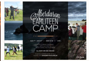
Aberdaron Camp check NEC website for dates