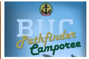
BUC Pathfinder Camporee 31st July - 7th August 2016