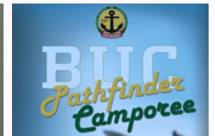
BUC Pathfinder Camporee 31st July - 7th August 2016