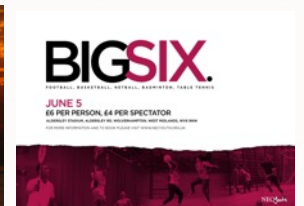
NEC Big Six June 5th