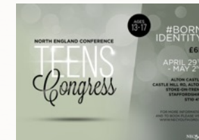
Teens Congress April 29th - May 2nd