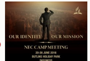
NEC Camp Meeting 20th-26th June 2016